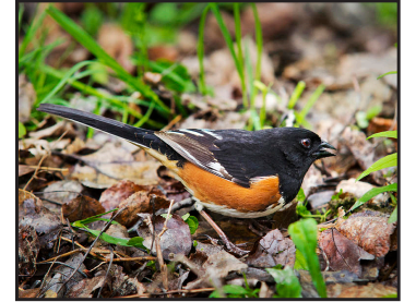
Pictured above is an Eastern Towhee who thrives off of leaf litter.

Try leaving leaves on your garden beds as mulch through the winter and allow them to naturally fertilize your plants and deter weed growth. If you don't like the look of your natural mulch you can top dress with wood mulch to cover your degraded leaves in Spring. Your butterflies, pollinators and birds will thank you. See these websites for more tips on leaves. Audubon.org and Almanac.com. Thank you for keeping Morganton beautiful. CAAC