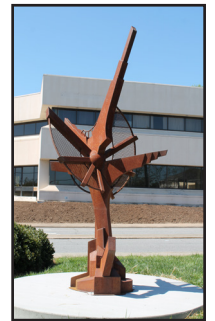
"Equity", located at N. Green and Patterson Street. Artist: Nathan Pierce, Cape Girardeau, MO

Voting will happen during the Morganton Festival on September 8-9. To cast your vote, please visit one of the information booths located at either the intersection of N. Green St/W. Union St or Sterling St/Meeting St. We want to hear from you!