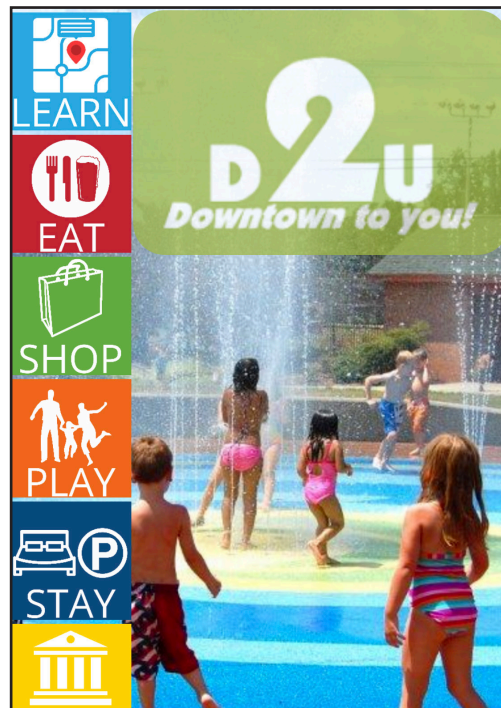
The new Downtown Morganton App is designed to connect citizens to the city's core. Download it now in the Apple App Store or Google Play Store.

To download the app from the Apple App Store or Google Play Store, simply search "Morganton" and hit download.