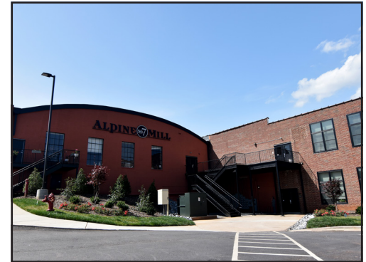
Alpine Mill turned the old Drexel Heritage furniture plant into a thriving mixed-use development.