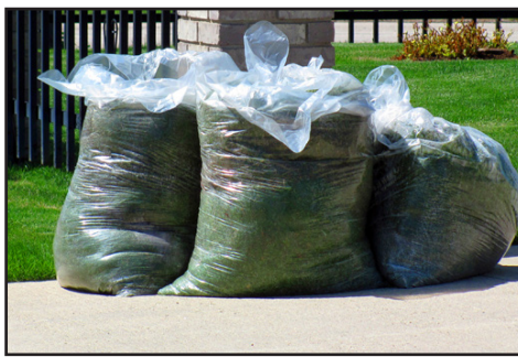
You can bag your clippings for collection and disposal.

If you have questions, call the Public Works Department at 828-438-5248.